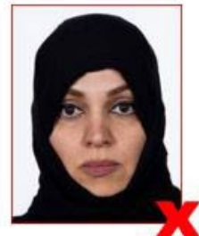
Eyes/edges of face obscured