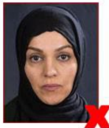
Background too dark