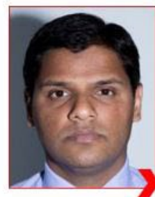
Shadows on image and background