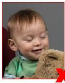
Eyes not open/toy visible